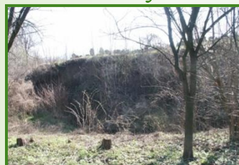
Gravestones at the brink of the hillside