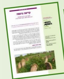
Fundraising pamphlet distributed among the family