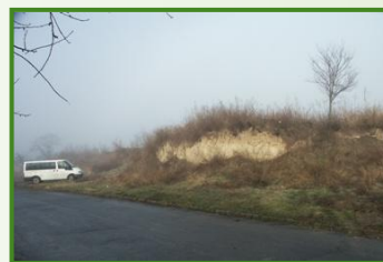
HFPJC evaluating the cemetery