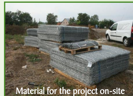
Material for the project on-site

Matzeiva of the Rav of Goncruzka: פ"נ א'ו'ח'ה' (אורים ותומים חושן המשפט) החרף המופלג הרב אב"ד ממ"ה שרגא פייבוש ב"מ אורי נפטר ביום ג' לחודש אדר שני בשנת תקפ"א תנצב"ה