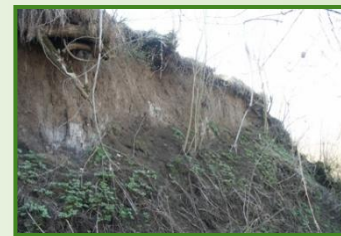
The swamped hillside of the cemetery