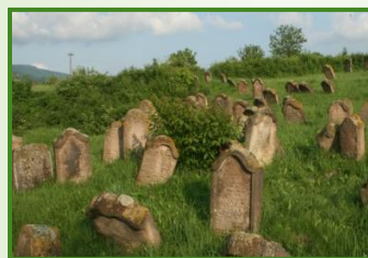
The terrible condition of the cemetery

Once Phase A is completed, we anticipate launching Phase B – construction of a strong fence and restoration of the gravestones.